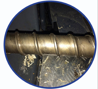
Middle section after using PVC Purge