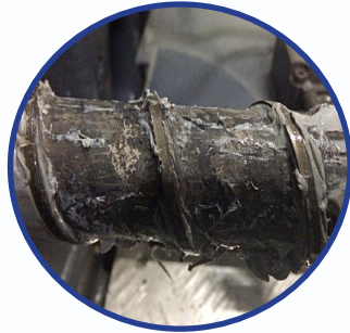
Degradation left on metering section using competitor's purge