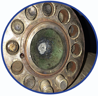
Degradation left in end cap using competitor's product