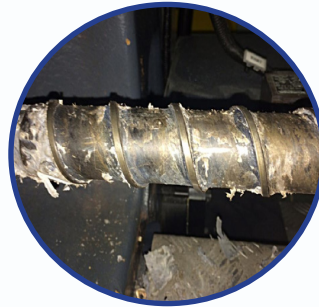
Degradation left in middle section using competitor's purge