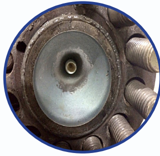
End cap after using PVC Purge