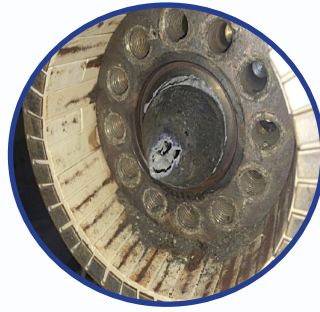
Degradation left on end of screw tip using competitor's product